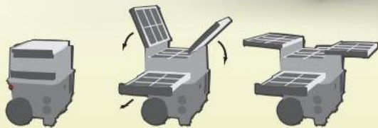
UNFOLD AND SLIDE OUT SOLAR PANELS

Additional separate solar panels and batteries can be connected for even more power.