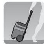
Collapsible Handle & Wheels for Transport