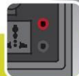
Terminals for Solar Panel Expansion